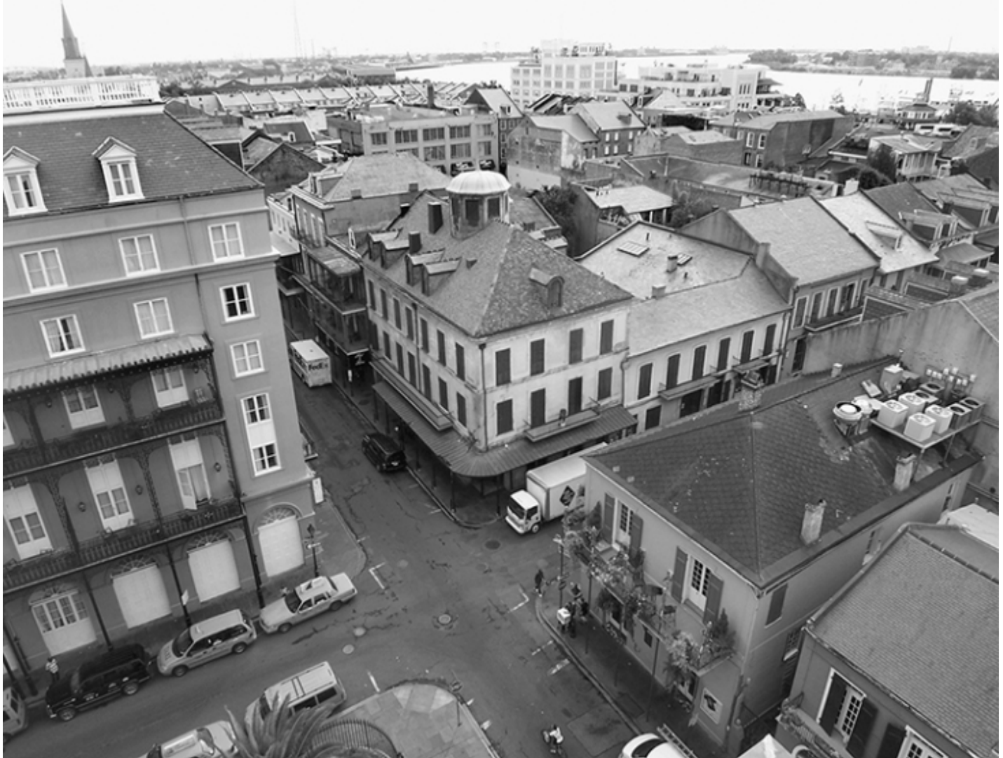
This French Quarter intersection of St. Louis and Chartres Streets was once a busy site for slave auctions in the city.

written evidence that French real estate tax codes motivated the narrow lots that characterize the historic heart of the city. The French Quarter has flooded. Multiple times. New Orleans has not always been frozen in time; it is not a complete anomaly. The city went through the same architectural trends as other cities in the United States. At various times it embraced Greek Revival, Richardson Romanesque, Italianate, late-Victorian, California Bungalow, and even International Style modernism.