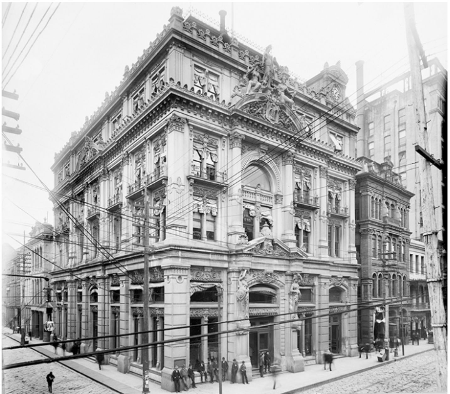
The original New Orleans Cotton Exchange, built in 1881.

structure and surrounding region. But tragedy strikes when only a few months later, it burns to the ground. Also, while arguing about the need for water remediation in the city, he points to the “Dutch Dialogues” initiative of the architecture firm Waggoner & Ball, ( https://wbae.com ) in which the Tulane School of Architecture, ( http://architecture.tulane.edu ) its faculty, and students play a pivotal role. This work speaks to the academy (and could be used in an academic setting), but not only the academy, given that the essays were not written specifically for that audience.