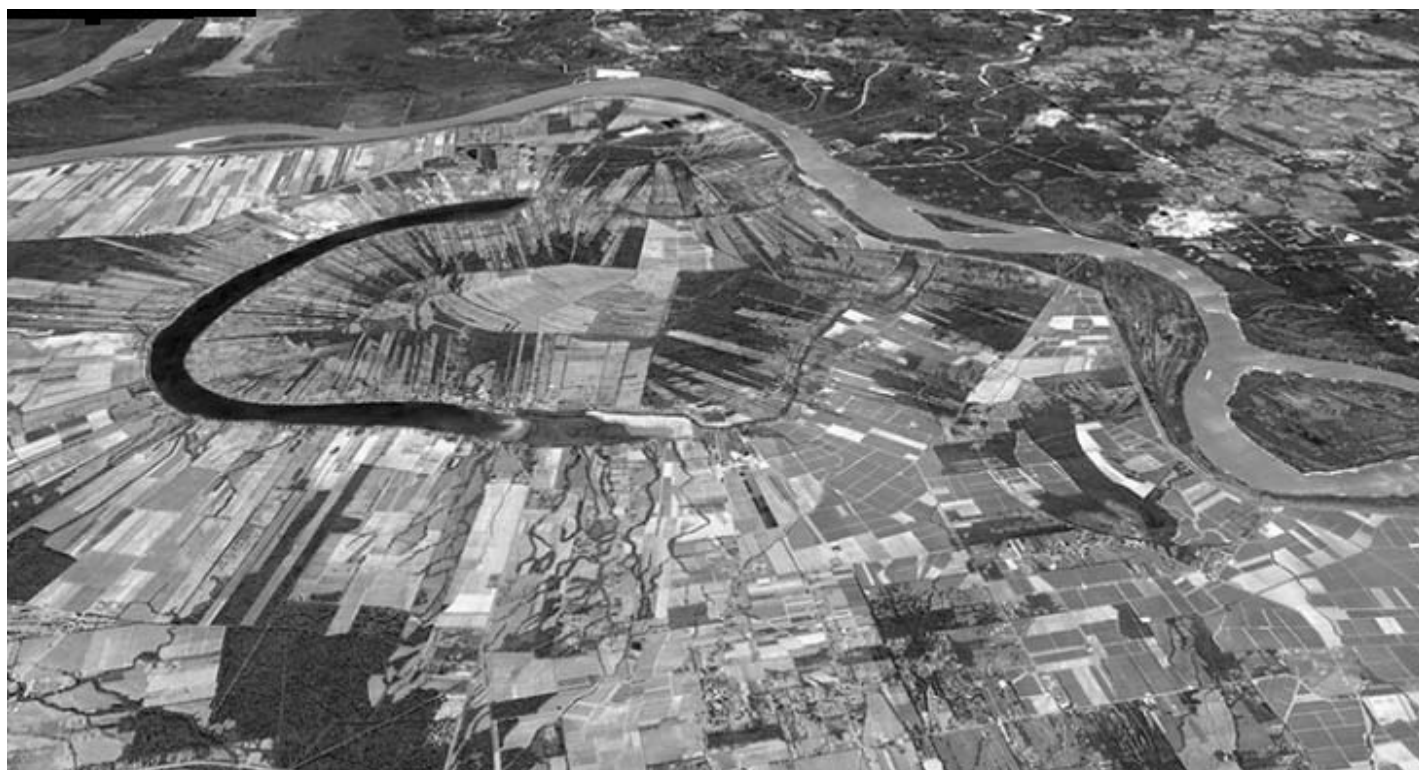
The False River area shows three distinct land surveying systems: French (left), American (lower right), and English (upper right).

From this collection of essays, though not imagined as a single manuscript with an underlying argumentative stance, it is possible to extract some central arguments that ground the larger work. The main argument is that we need to unlearn what we thought we knew about the city to facilitate a more critical and holistic approach to research and discovery. The three essays that capture these feelings in the most direct manner are “The Seduction of Exceptionalism,” “A Glorious Mess: A Perceptual History of New Orleans Neighborhoods,” and “New Orleans as Metaphor.”